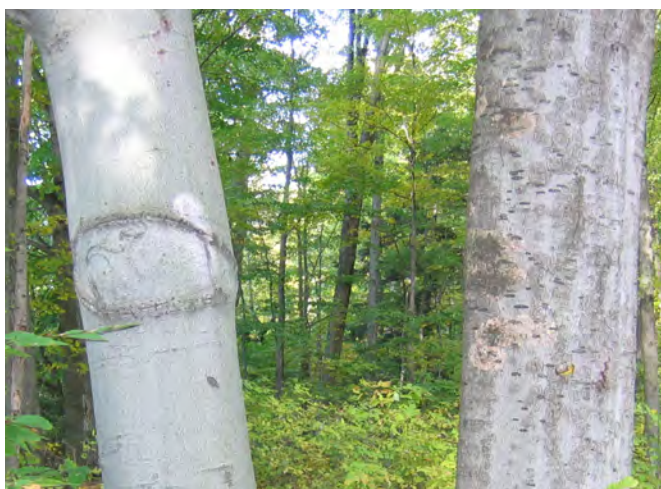
Figure 10. The canker-free tree on the left is resistant to beech scale. The tree on the right is heavily diseased.

In rare cases, trees remain canker free even after more than 10 years of heavy scale feeding, suggesting resistance to the canker fungus. In other cases, only restricted canker growth is observed on infected trees, suggesting that they are disease tolerant . Such trees often survive for many years with only superficial damage. Although not well documented, disease tolerance is probably related to tree vigour and environmental conditions at the time of infection. Trees exhibiting tolerance during an initial infection phase may succumb to subsequent infections if they are subject to other stressors such as drought, insect defoliation, or root disease (Figure 11).