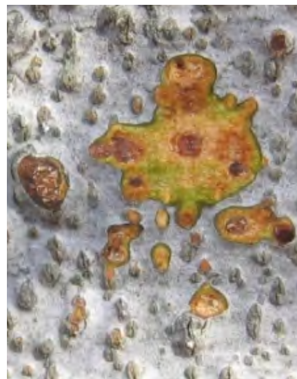
Figure 8. Superficial necrotic bumps caused by scale feeding. Some outer bark has been removed to expose the associated small brown lesions; these do not extend to the inner bark and cambium.