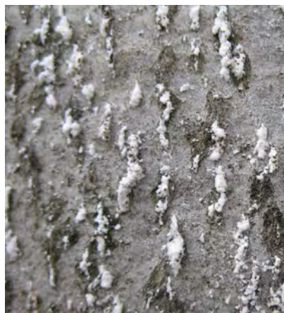
Figure 5. White woolly tufts in bark crevasses are beech scale.