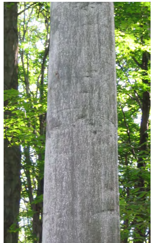
Figure 6. In heavy infestations, the entire bole of the tree is covered with scale.