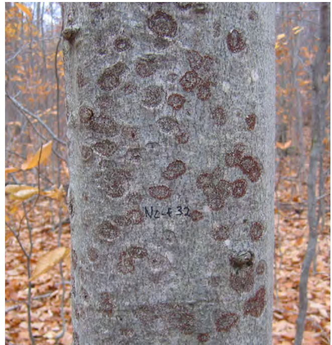
Figure 1. Cankers caused by Neonectria faginata on the stem of a beech tree.

The disease is initiated when the beech scale feeds on the outer bark of beech trees. Usually the larger trees in a stand are attacked first. Although they do not kill trees, scale infestations reduce tree vigour and growth, and lower tree resistance to fungal infection. Within 2 to 10 years of the arrival of the scale insect, the feeding wounds become infected with N. faginata . The fungus grows into and can kill the tree's inner bark and cambium, creating many circular or lemon-shaped cankers (Figure 1). Infection usually occurs on the lower bole of the tree but cankers can extend into the crown. The cankers may develop into large vertical patches of dead bark (Figure 2) or encircle the entire bole (Figure 3). Branches above large patches of dead bark often show signs of decline, producing little to no foliage. Large trees are the first to become diseased and to exhibit crown dieback. Trees with BBD are more susceptible to invasion by decay fungi and insects and their combined effects can result in stem breakage during wind events.