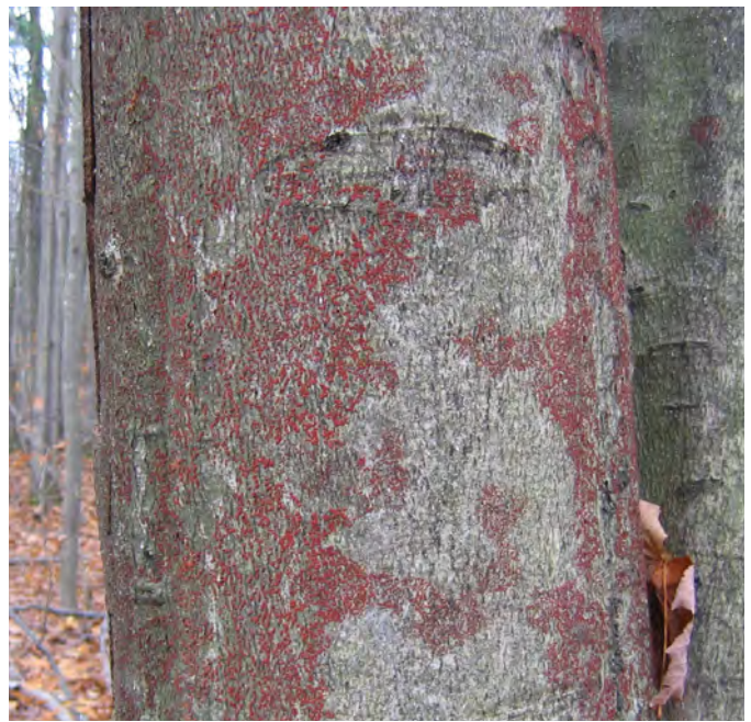
Figure 3. Beech bark disease cankers can encircle the entire bole of a tree.