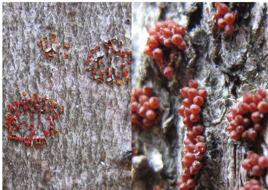
Figure 7. Clusters of red fruiting bodies of Neonectria faginata develop in cankers on beech trees.

Under certain climate conditions, additional waves of BBD may occur in aftermath forests, followed by extensive tree mortality. For example, winter temperatures that remain above -25 °C favour the build-up of beech scale populations. Several years of drought are also reported to increase beech susceptibility to BBD, resulting in increased disease and tree mortality levels.