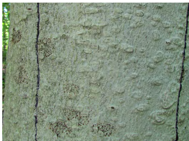
Figure 11. Older, inactive cankers on the right side of this beech tree did not penetrate through the living bark. A more recent infection on the left side produced active cankers that grew through the inner bark to the cambium.