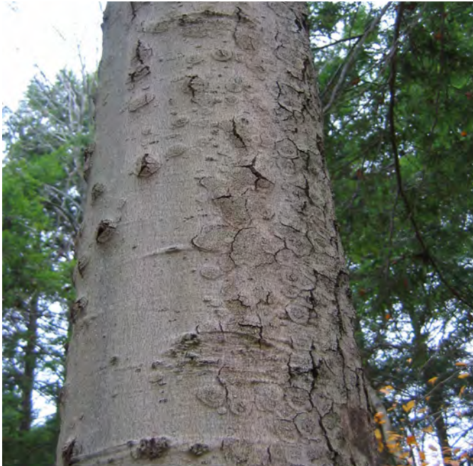
Figure 2. The bark on the right side of this beech tree has been killed by beech bark disease.