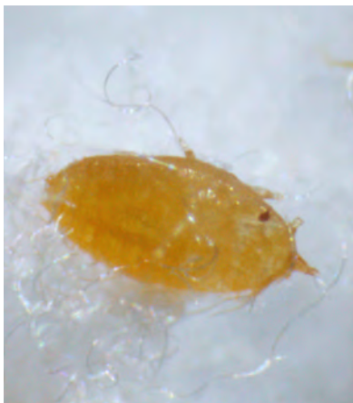
Figure 4. Mature beech scale (white wax filaments were removed to expose the insect).

The following spring, crawlers moult into adults that continue to feed in place. Initial scale infestations are more common on larger trees ( \geq 20 cm in diameter), possibly because their larger bole or crown provides a larger area to intercept tiny crawlers blown from other infested trees. Small scale colonies look like woolly tufts in bark crevasses (Figure 5); larger colonies can cover the entire main stem (Figure 6).