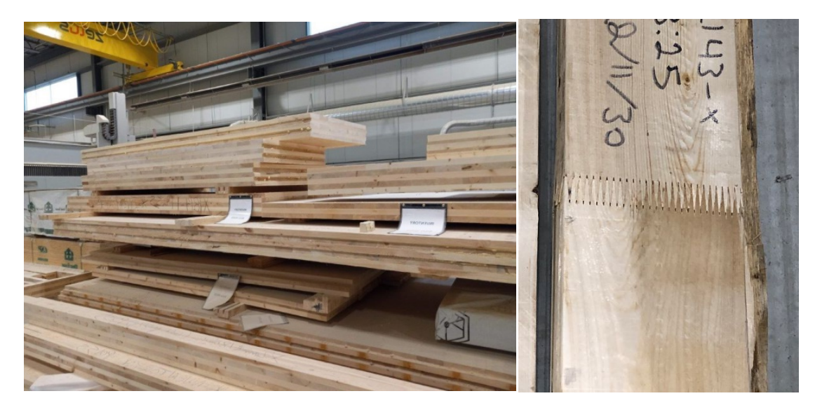
Sections of finished beams for a project